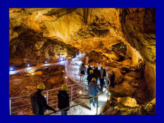
UNESCO World Heritage Site